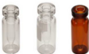
30211LNG-12, 30211LMNG-12, 3011LNG-12A

Shelf Pack - 100 pieces; Case Pack - 1000 pieces